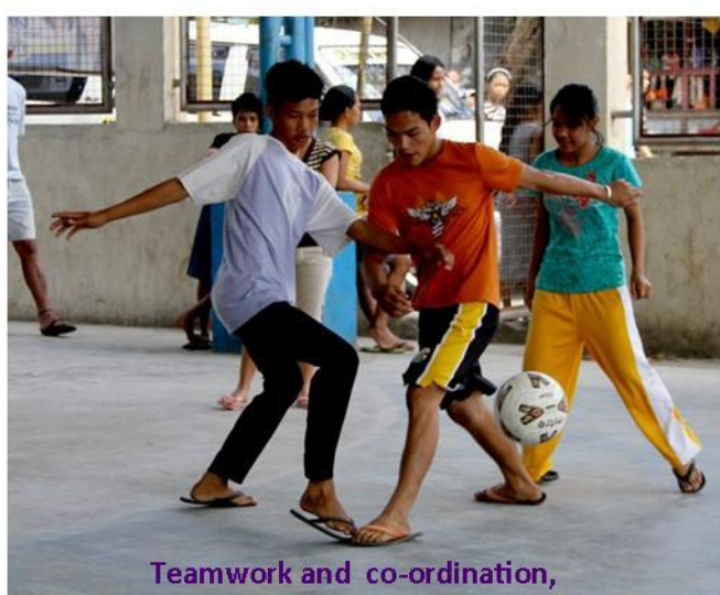
Teamwork and co-ordination,